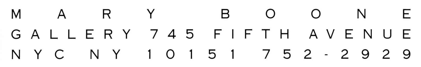
"Alors, La Chine?", Centre Pompidou, Paris, France.